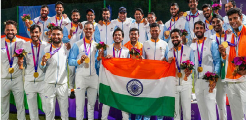
Victorious Men's Cricket team