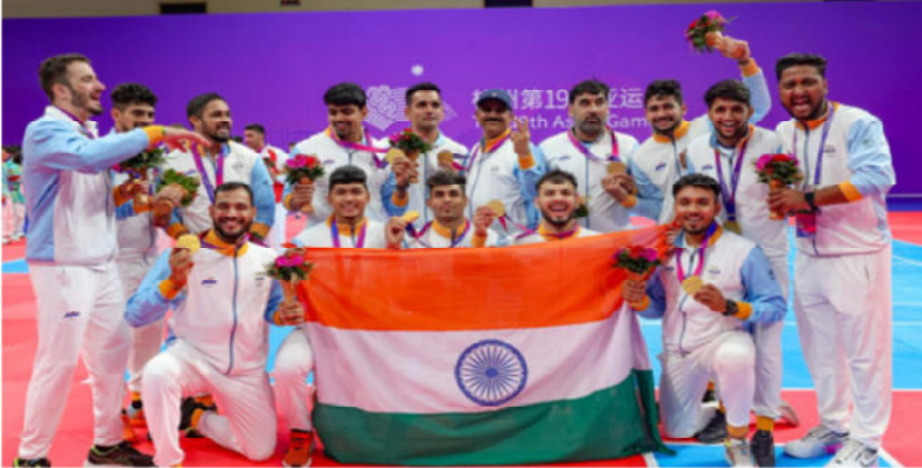
Victorious Men's Kabaddi team