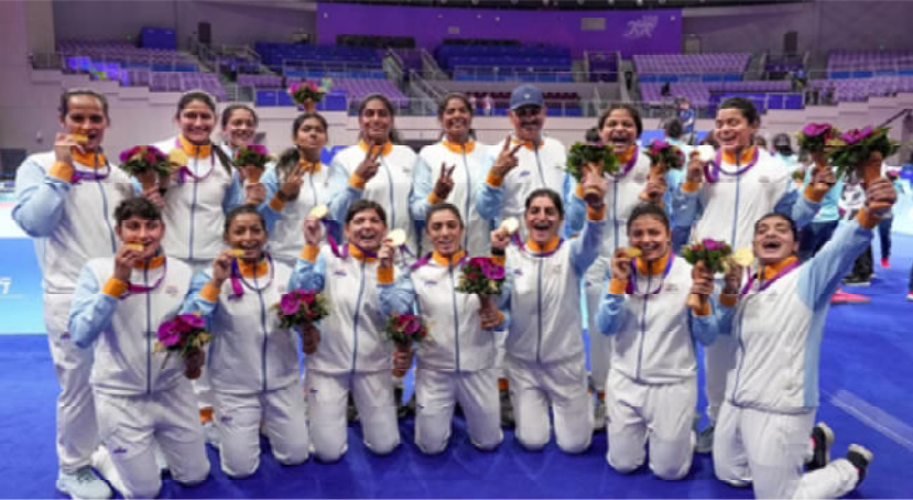
Victorious Women's Kabaddi team